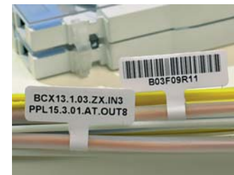
▶ Tags for small diameter cables. PTLFT-01-425