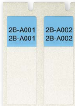
▶ Cable labels are available in colors. PTL-29-427-BL

Cable sizes vary by manufacturer, so it is always recommended to try a particular size for your application.