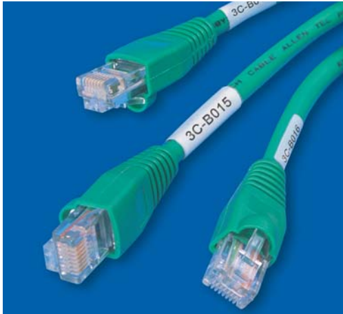
▶ 4 pair cables with PTL-31-427