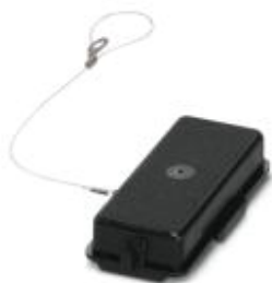
Protective cover B16, for single locking latch, protective cover material: PA, height: 18.5 mm, seal: no, diameter of retaining cord eyelet: 40 mm

Please be informed that the data shown in this PDF Document is generated from our Online Catalog. Please find the complete data in the user's documentation. Our General Terms of Use for Downloads are valid ( http://phoenixcontact.com/download )