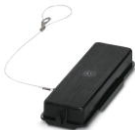
Protective cover B24, for single locking latch, protective cover material: PA, height: 18.5 mm, seal: no, diameter of retaining cord eyelet: 40 mm

Please be informed that the data shown in this PDF Document is generated from our Online Catalog. Please find the complete data in the user's documentation. Our General Terms of Use for Downloads are valid ( http://phoenixcontact.com/download )