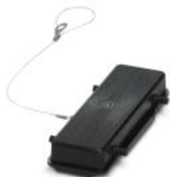
Protective cover B24, for double locking latch, protective cover material: PA, height: 18.5 mm, seal: no, diameter of retaining cord eyelet: 40 mm

Please be informed that the data shown in this PDF Document is generated from our Online Catalog. Please find the complete data in the user's documentation. Our General Terms of Use for Downloads are valid ( http://phoenixcontact.com/download )