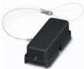
Protective cover D15, for single locking latch, protective cover material: PA, height: 20.5 mm, seal: yes

Please be informed that the data shown in this PDF Document is generated from our Online Catalog. Please find the complete data in the user's documentation. Our General Terms of Use for Downloads are valid ( http://phoenixcontact.com/download )