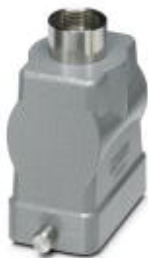
HEAVYCON sleeve housing B10, for single locking latch, height 72 mm, with support 1x M25, straight conductor exit

Please be informed that the data shown in this PDF Document is generated from our Online Catalog. Please find the complete data in the user's documentation. Our General Terms of Use for Downloads are valid ( http://phoenixcontact.com/download )