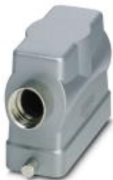
HEAVYCON B16 sleeve housing, for single locking latch, height: 76 mm, with 1 x M25 gland, lateral cable outlet

Please be informed that the data shown in this PDF Document is generated from our Online Catalog. Please find the complete data in the user's documentation. Our General Terms of Use for Downloads are valid ( http://phoenixcontact.com/download )