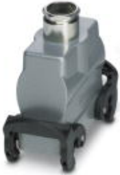
HEAVYCON B16 sleeve housing, with double locking latch, height: 72 mm, with 1 x Pg21 screw connection, straight cable outlet

Please be informed that the data shown in this PDF Document is generated from our Online Catalog. Please find the complete data in the user's documentation. Our General Terms of Use for Downloads are valid ( http://phoenixcontact.com/download )