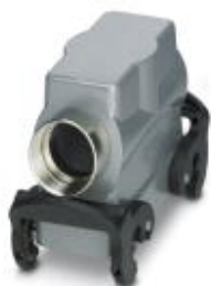
HEAVYCON B16 sleeve housing, with double locking latch, height: 72 mm, with 1 x M32 gland, lateral cable outlet

Please be informed that the data shown in this PDF Document is generated from our Online Catalog. Please find the complete data in the user's documentation. Our General Terms of Use for Downloads are valid ( http://phoenixcontact.com/download )